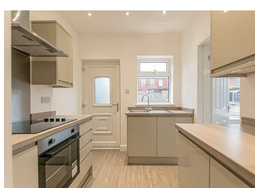
30 Bolton Old Road, Atherton, M46 9DL