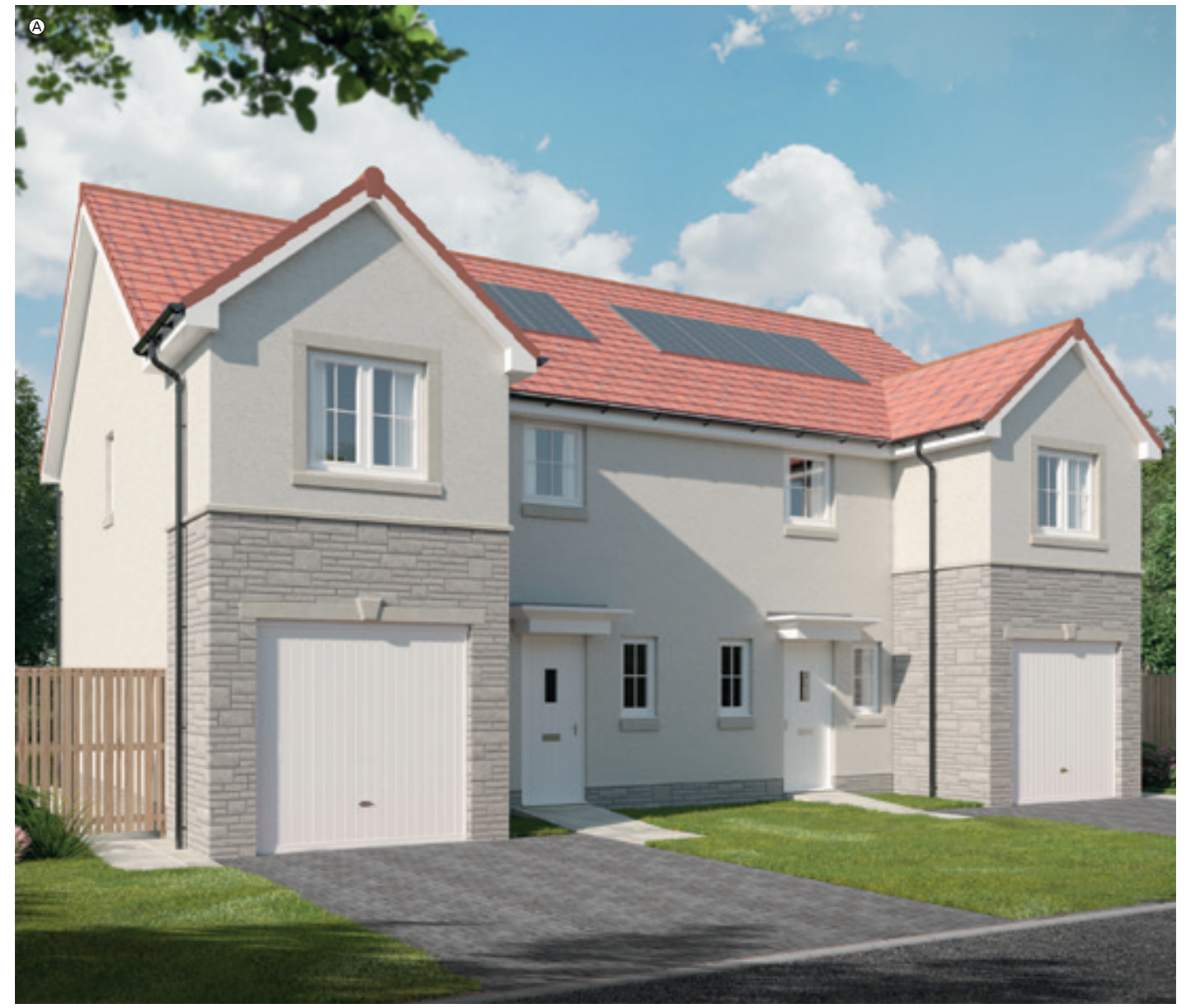
Please \ note \ Photo \ Voltaic \ (solar) \ panels \ shown \ above \ are \ indicative \ only. \ The \ location \ and \ number \ of \ panels \ are \ dependent \ on \ plot \ orientation. \ Please \ see \ Sales \ Advisor \ for \ details \ details \ dependent \ on \ plot \ orientation.

Bellway Homes Limited (Scotland East) 6 Almondvale Business Park Almondvale Way, Livingston, West Lothian EH54 6GA