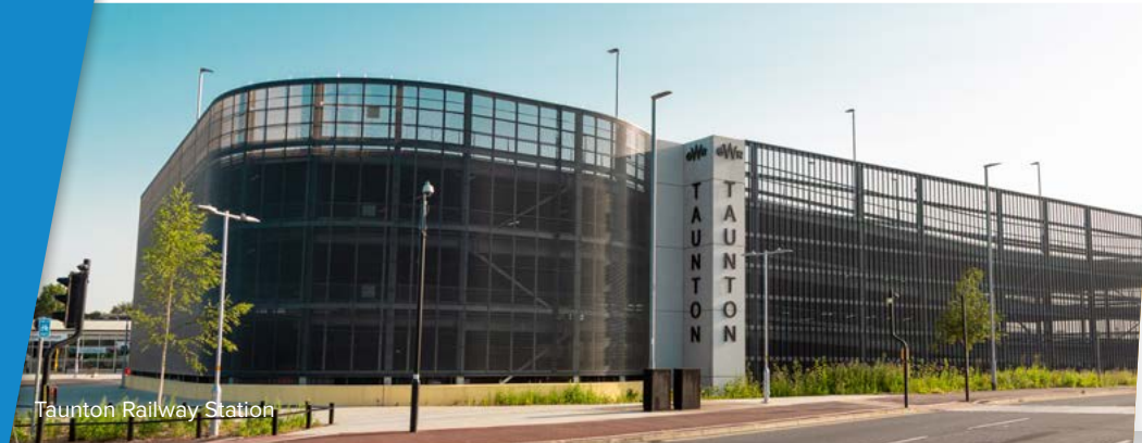
Taunton Railway Station