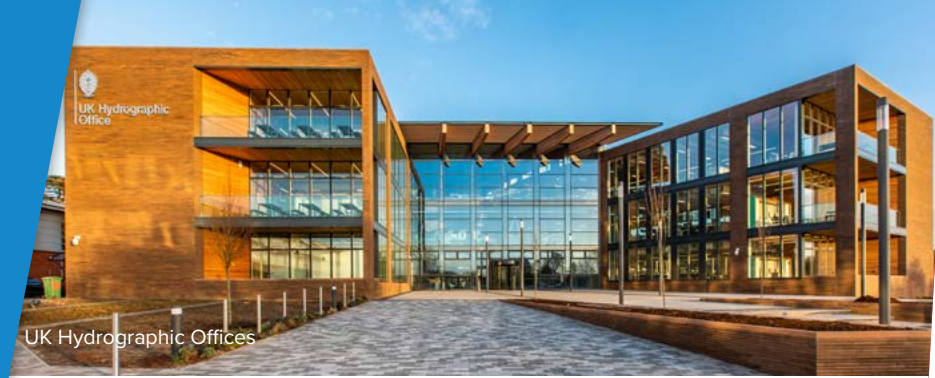
UK Hydrographic Offices

The park features a range of facilities whilst the adjacent Hankridge Retail Park includes a number of retail outlets and Sainsbury’s superstore with further leisure facilities including an Odeon cinema and bowling alley. The Blackbrook Pavilion Leisure Complex, situated immediately south of the Park comprises a range of sporting facilities including a gym.