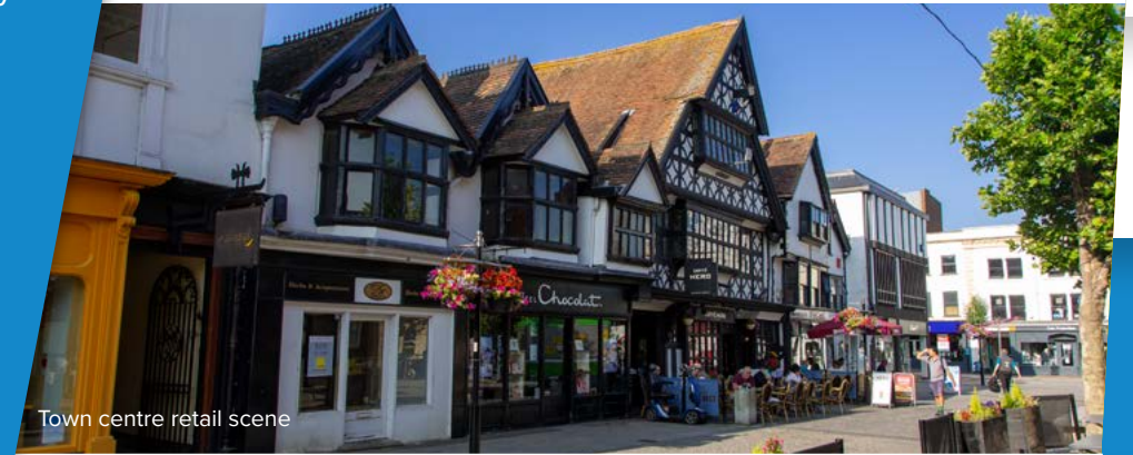
Town centre retail scene