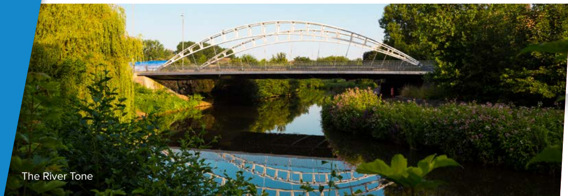
The River Tone