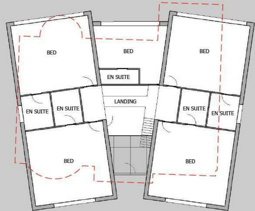
Proposed Ground Floor