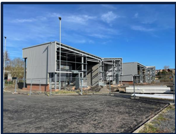
Unit under construction