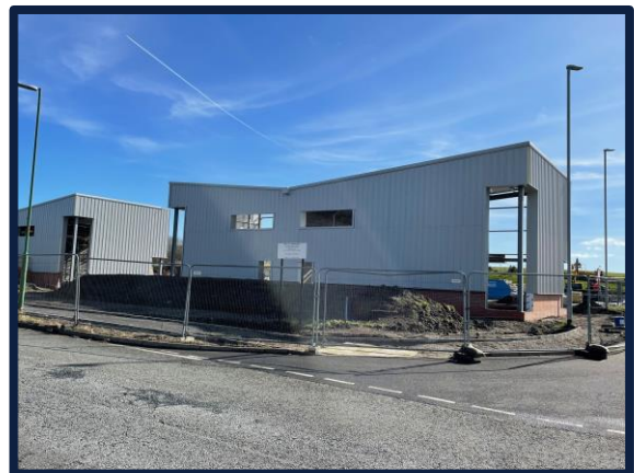
Unit under construction

All figures quoted above are exclusive of VAT where chargeable.