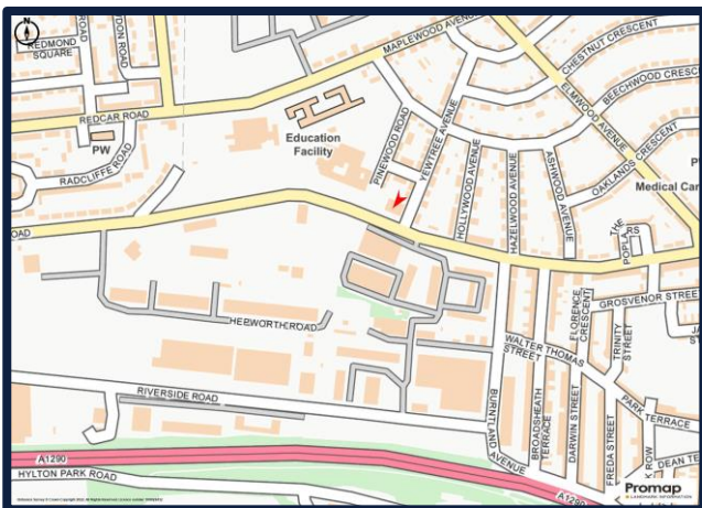
Location street plan

YoungsRPS is registered in England no: 08979919. Registered office Myenza Building, Priestpopple, Hexham, Northumberland, NE46 1PS