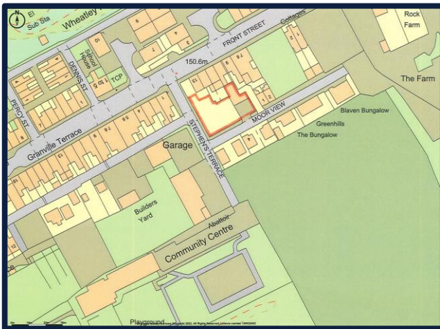
Detailed site plan

YoungsRPS is registered in England no: 08979919. Registered office Myenza Building, Priestpopple, Hexham, Northumberland, NE46 1PS