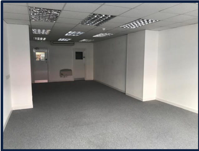
Ground floor interior