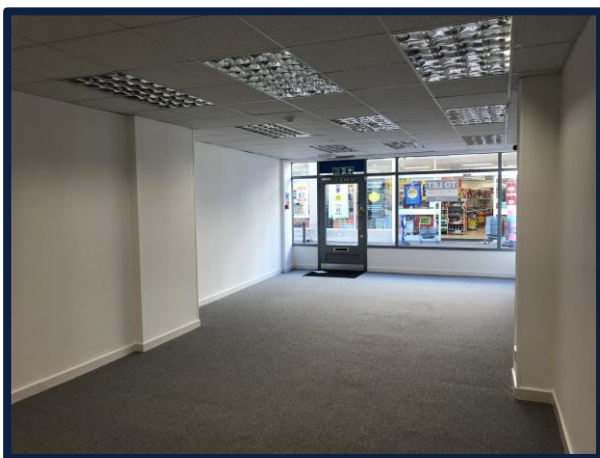
Ground floor interior

Externally, there is a yard to the rear, suitable for loading or parking two vehicles. Access to the yard is over the former Robbs department store.