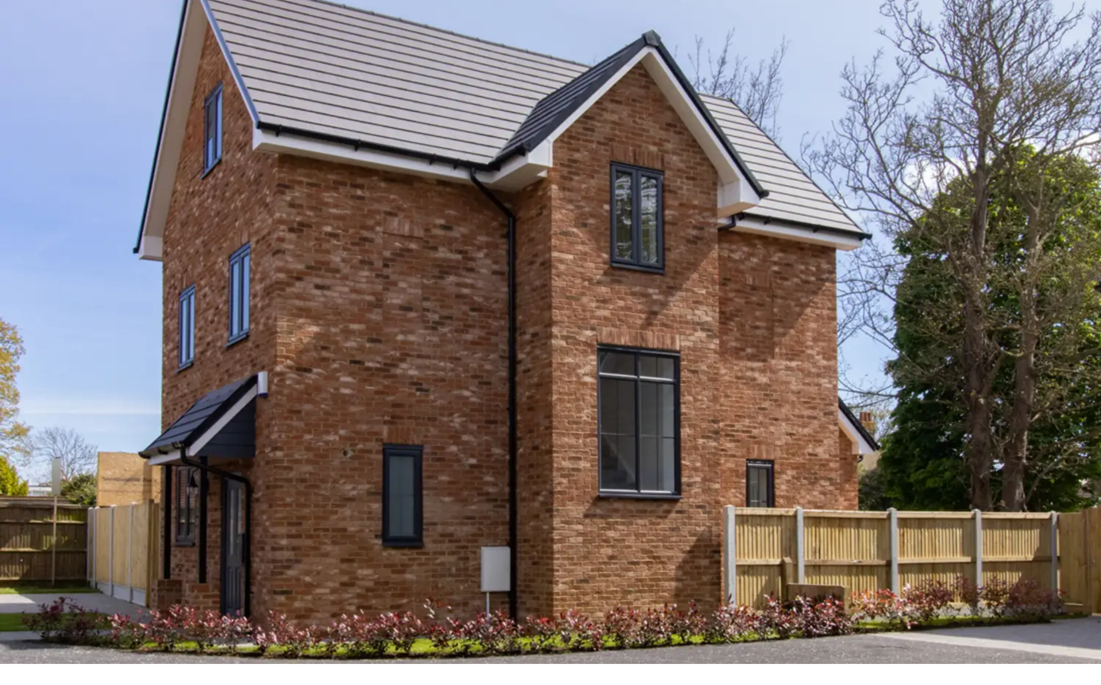
1 Osprey Rise, 130 Gladstone Road, Broadstairs £675,000