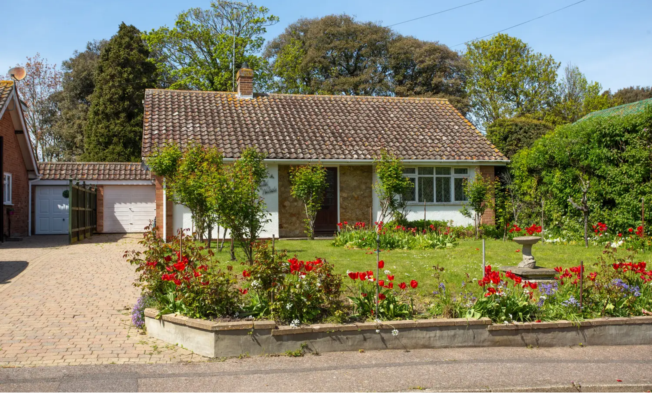
5 Woodland Way, Broadstairs In Excess of £400,000