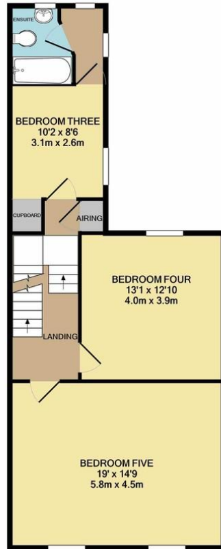
1ST FLOOR APPROX. FLOOR AREA 703 SQ.FT. (65.3 SQ.M.)