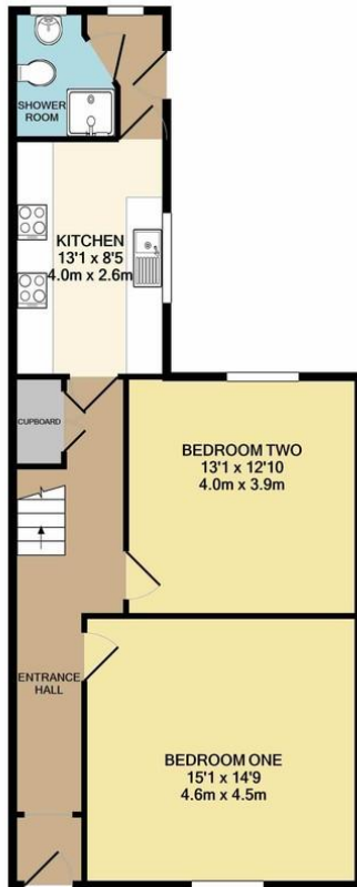
GROUND FLOOR APPROX. FLOOR AREA 701 SQ.FT. (65.1 SQ.M.)