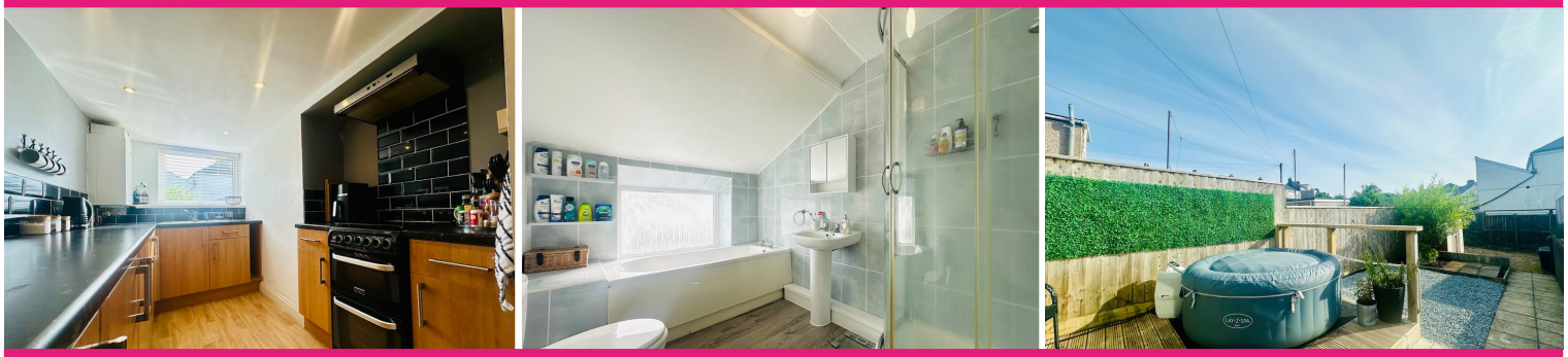
GROUND FLOOR 443 sq.ft. (41.1 sq.m.) approx.