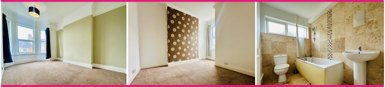
GROUND FLOOR 442 sq.ft. (41.0 sq.m.) approx.