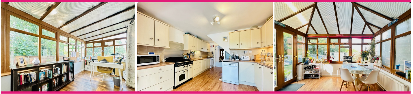
GROUND FLOOR 796 sq.ft. (74.0 sq.m.) approx.