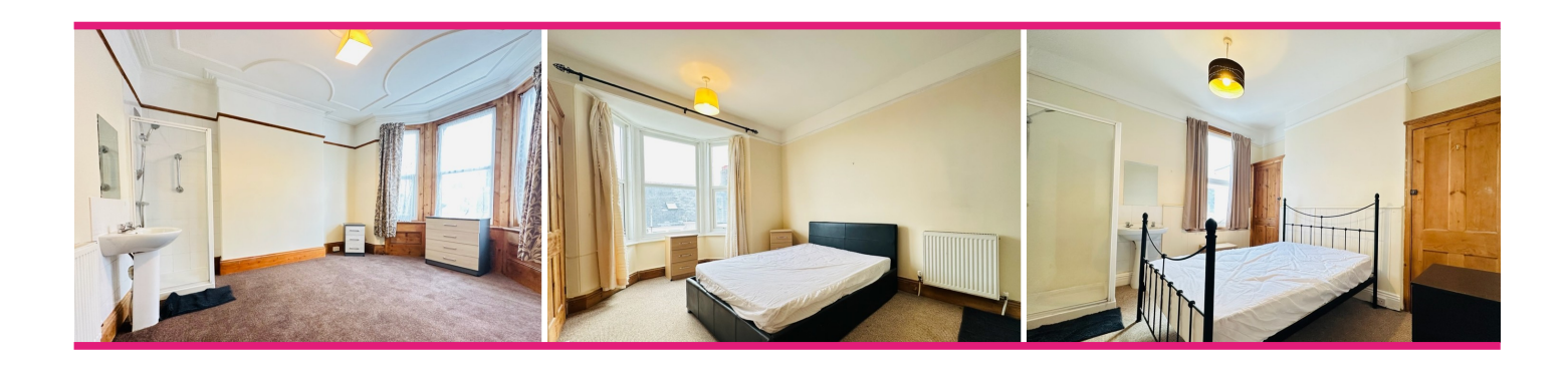
GROUND FLOOR 591 sq.ft. (54.9 sq.m.) approx.