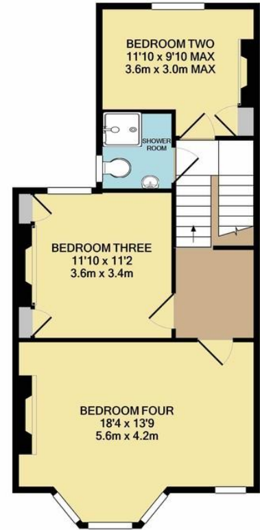
1ST FLOOR APPROX. FLOOR AREA 584 SQ.FT. (54.3 SQ.M.)

TOTAL APPROX. FLOOR AREA 1412 SQ.FT. (131.2 SQ.M.)