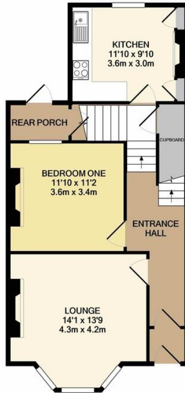
GROUND FLOOR APPROX. FLOOR AREA 609 SQ.FT. (56.6 SQ.M.)