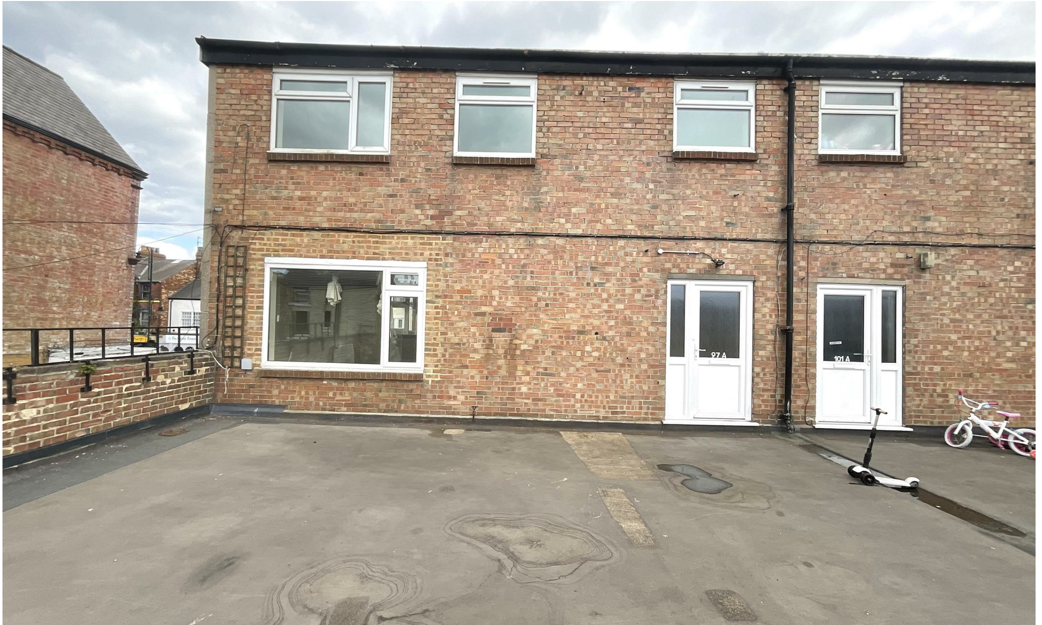
97A Falsgrave Road, Scarborough YO12 5EG £650