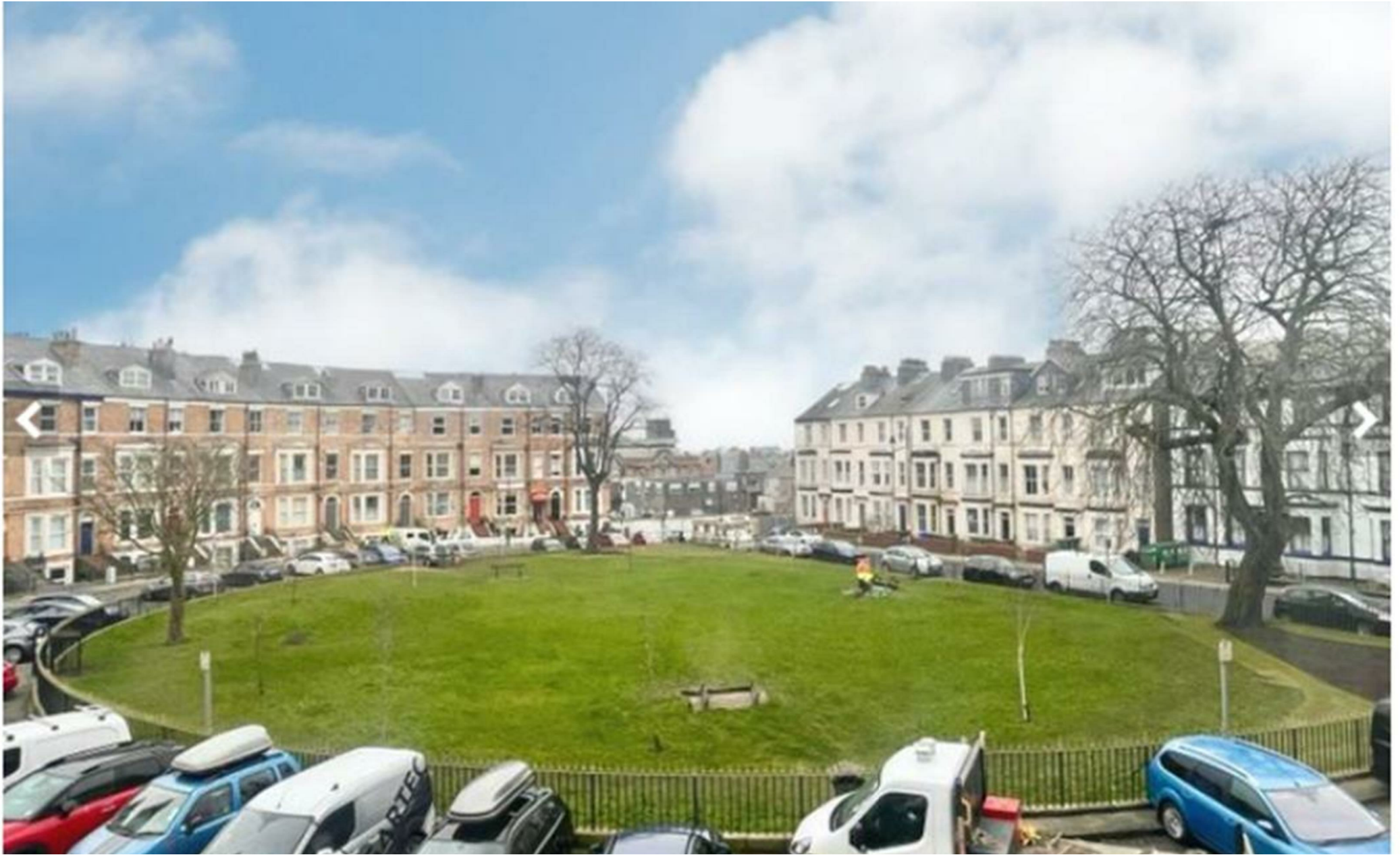
43 Albemarle Crescent, Scarborough YO11 1XX £650