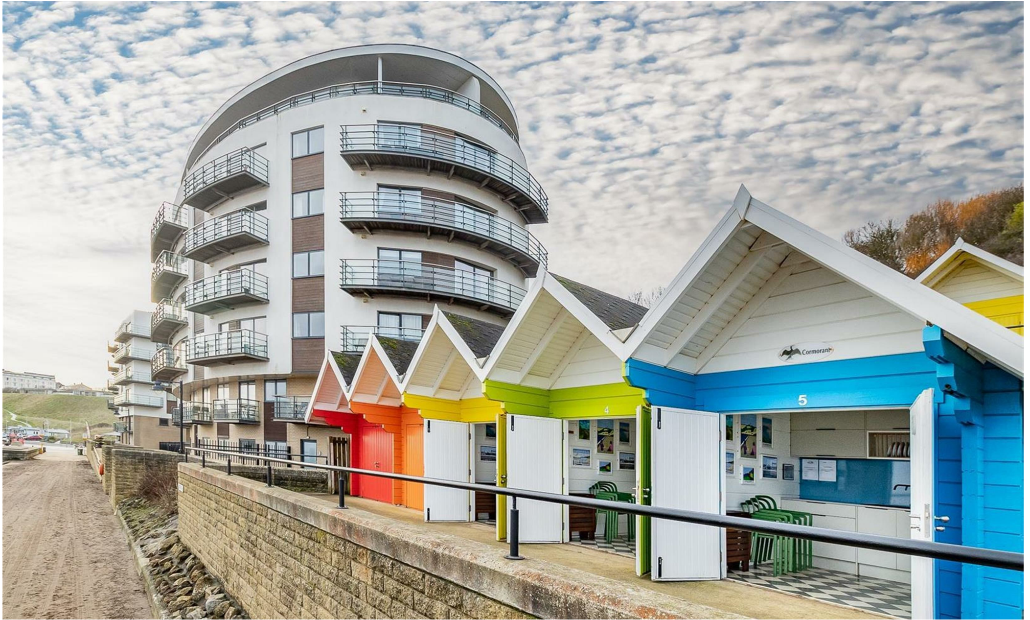
Kepwick House 203 The Sands, Peasholm Gap, Scarborough £1,500