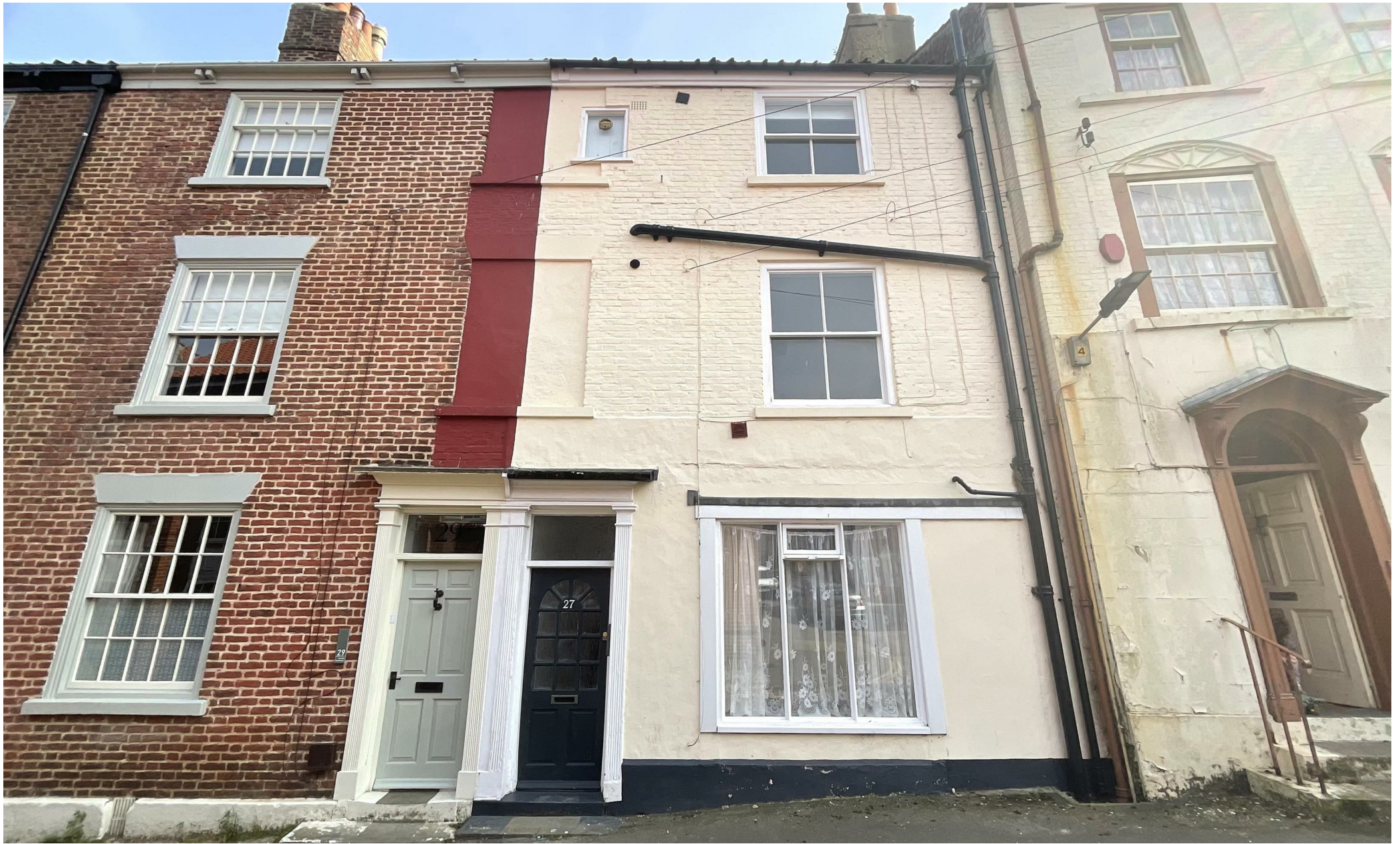
Flat 1, 27 St. Sepulchre Street, Scarborough YO11 1QG £650