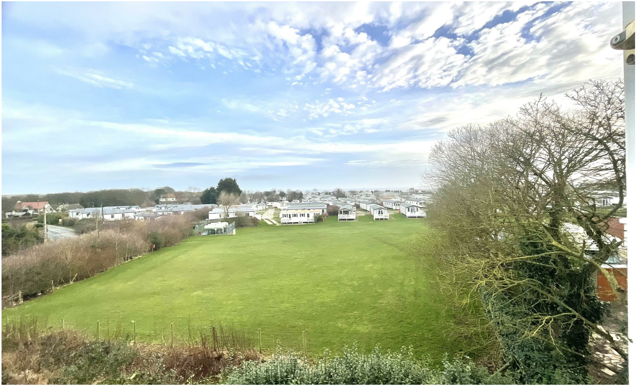
Flat 5, Newlands Court Primrose Drive, Primrose Valley YO14 9QT £700