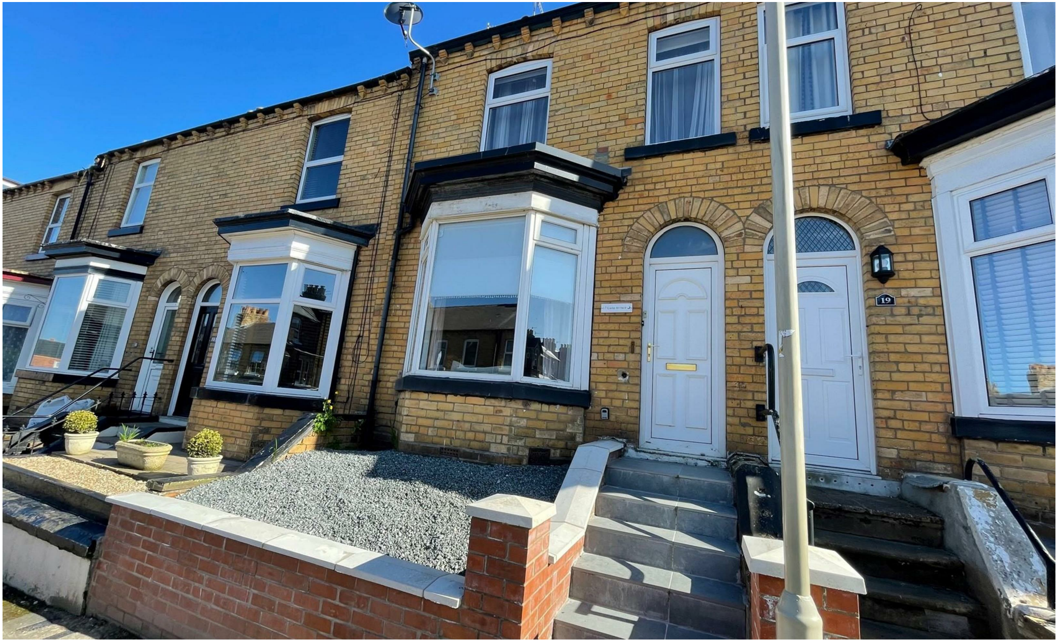
17 Franklin Street, Scarborough YO12 7JU £975 Per Calendar Month