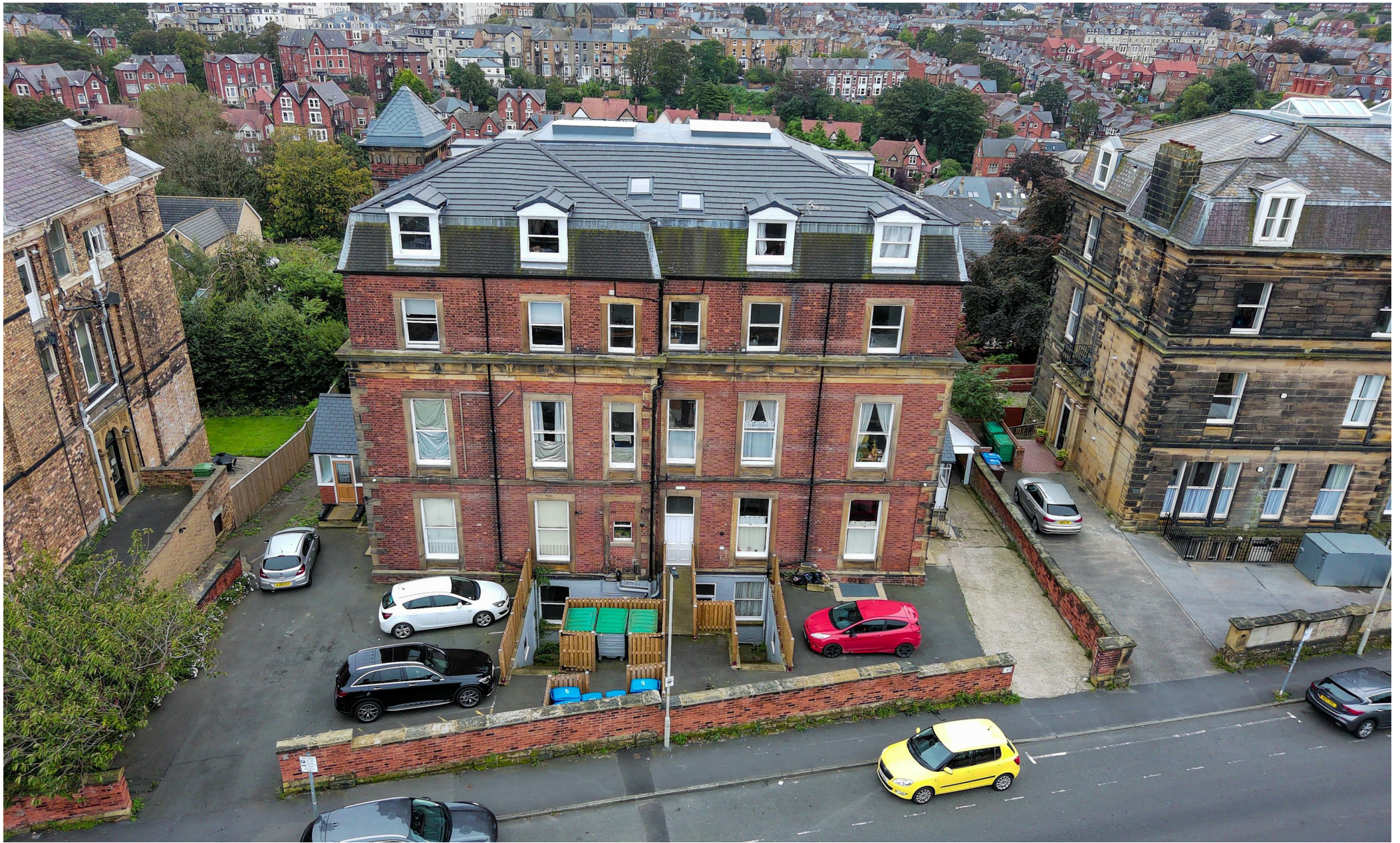
Flat 10, 5-6 Westwood, Scarborough YO11 2JD £600