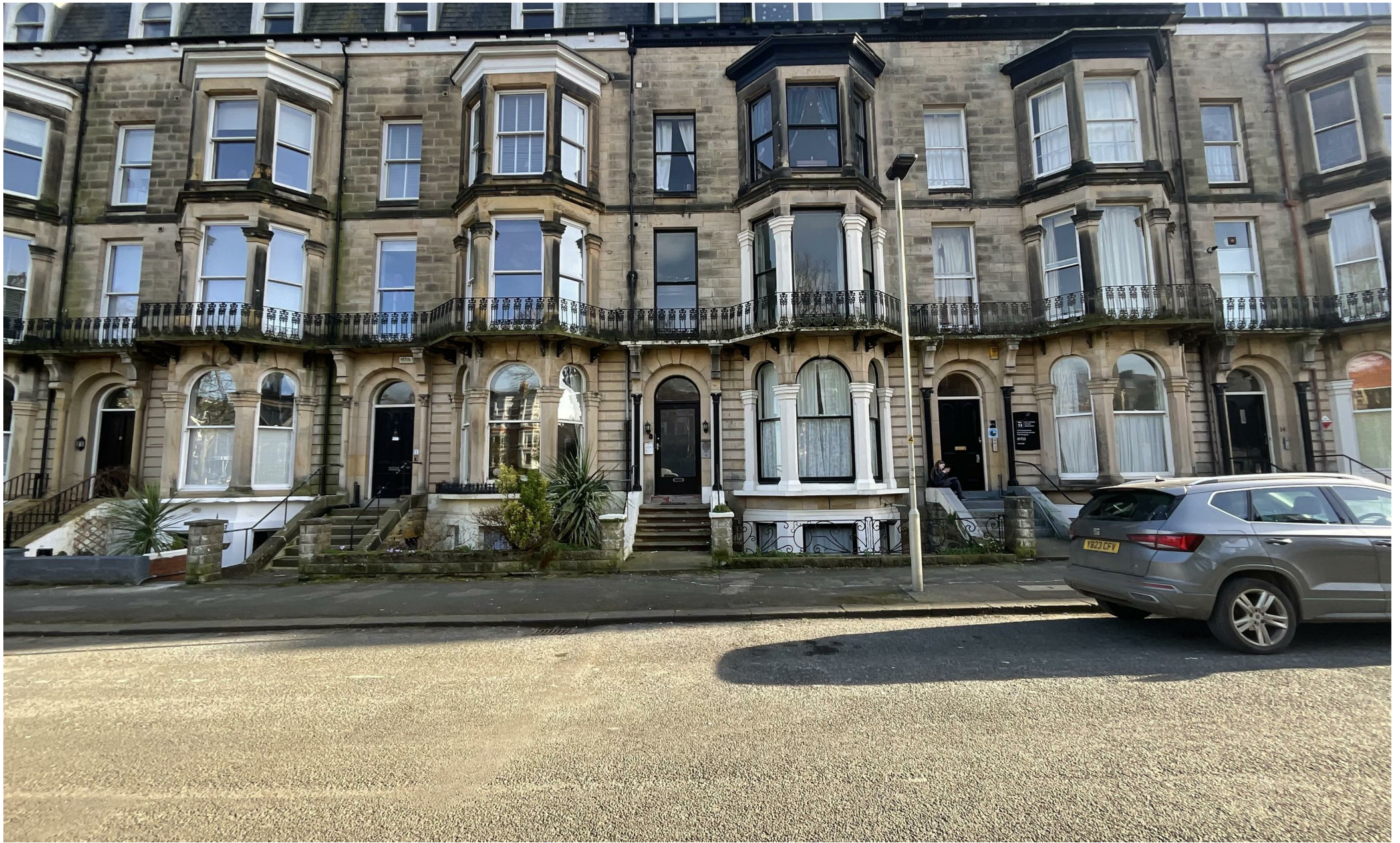
Apartment 4, 12 Esplanade Gardens, Scarborough YO11 2AW £750