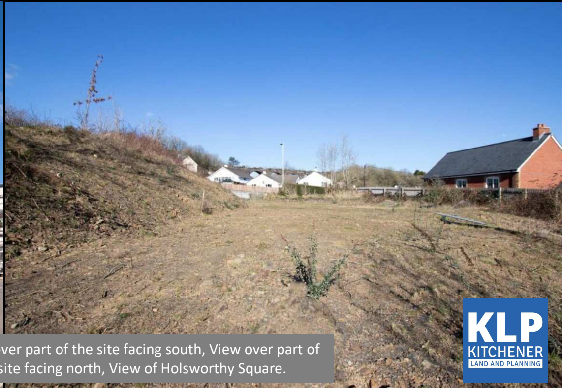
Photos (from top left clockwise) showing: View over part of the site facing south, View over part of the site facing north, View over part of the site facing north, View of Holsworthy Square.