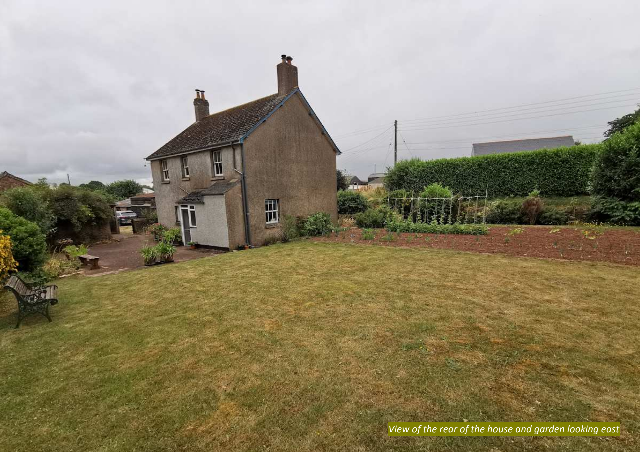
View of the rear of the house and garden looking east