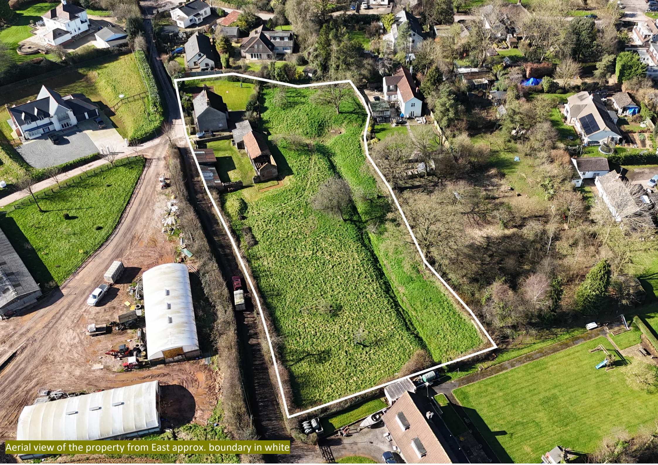
Aerial view of the property from East approx. boundary in white