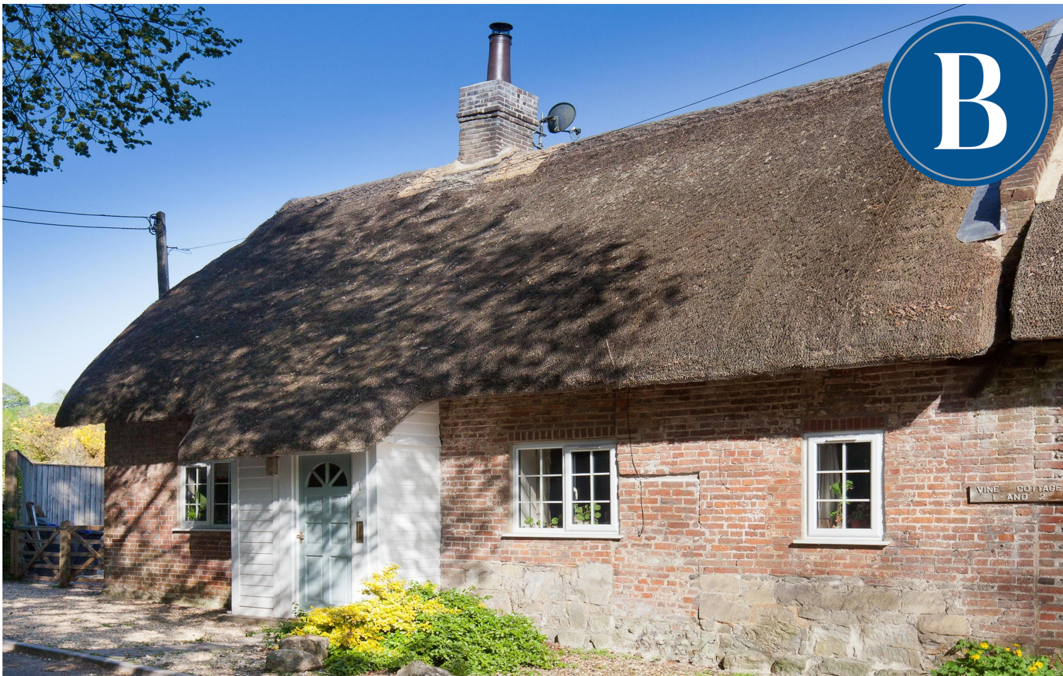
Vine Cottages, Ebbesbourne Wake