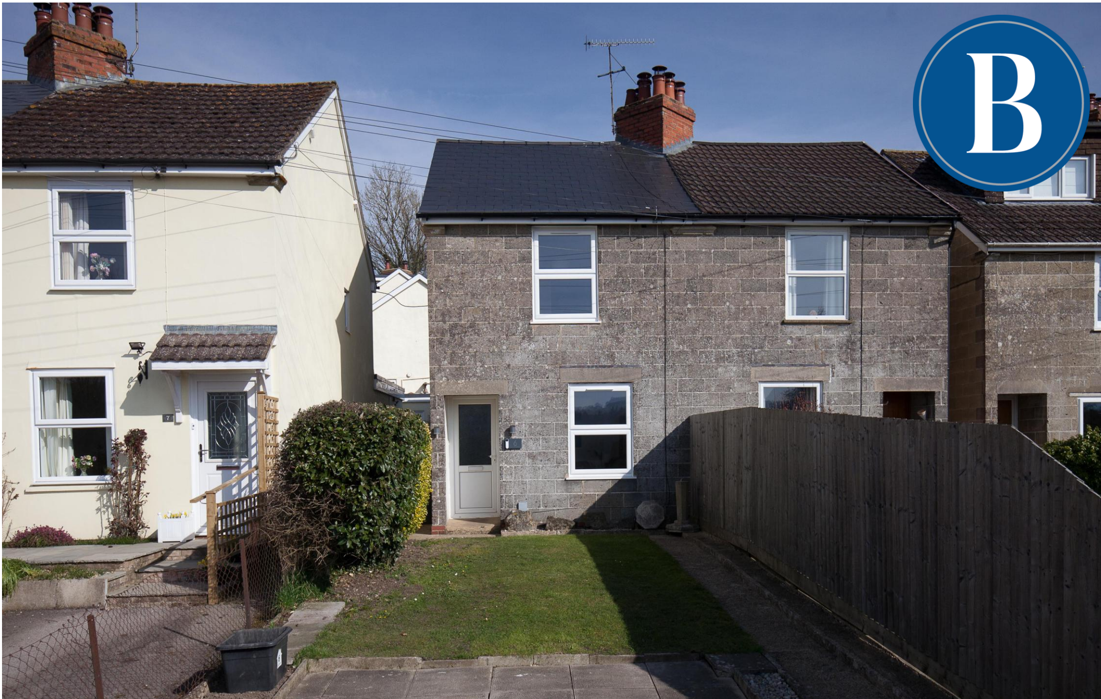
The Poplars, Barford St. Martin