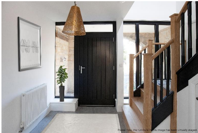
Please note, the furniture in this image has been virtually staged.

Strictly by appointment, only with Boatwrights. Please do get in touch to ask us about our 'Safe Viewings Guidelines' 01747 859 359. www.boatwrights.co.uk .