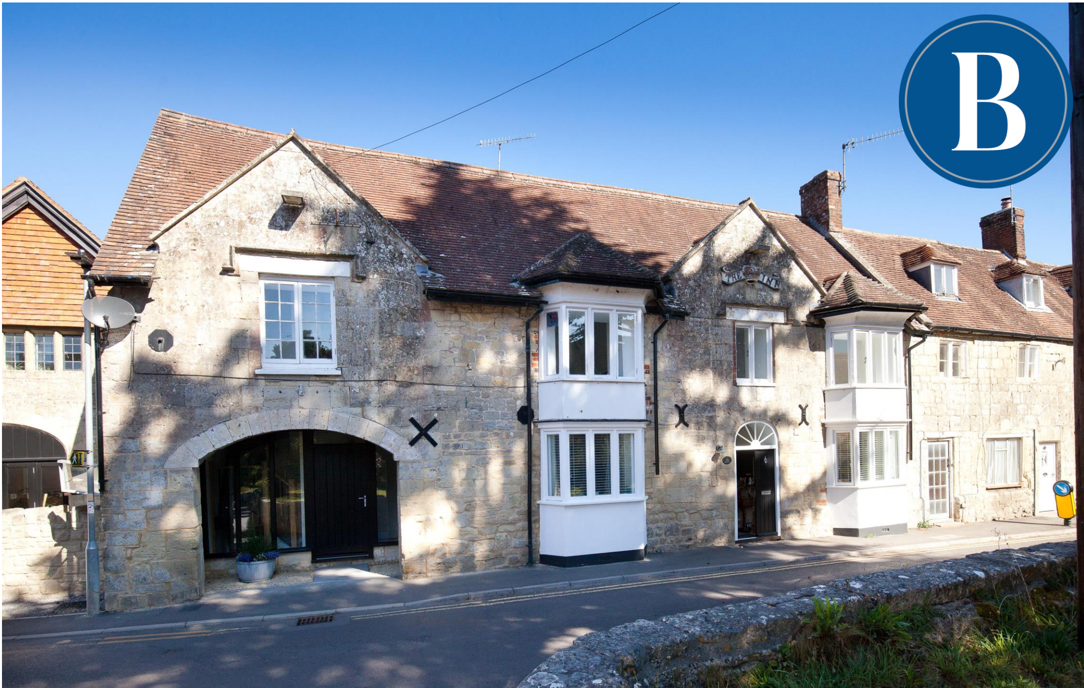
The Crown Church Street, Tisbury