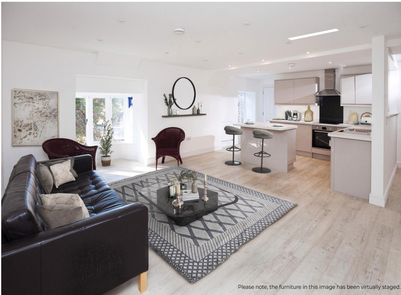
Please note, the furniture in this image has been virtually staged.