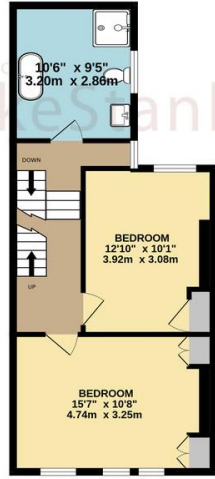
1ST FLOOR 476 sq.ft. (44.2 sq.m.) approx.

TOTAL FLOOR AREA: 1400 sq.ft. (130.0 sq.m.) approx. Whilst every attempt has been made to ensure the accuracy of the floorplan contained here, measurements of doors, windows, rooms and any other items are approximate and no responsibility is taken for any error, omission or mis-statement. This plan is for illustrative purposes only and should be used as such by any prospective purchaser. The services, systems and appliances shown have not been tested and no guarantee as to their operability or efficiency can be given. Made with Metropix ©2024