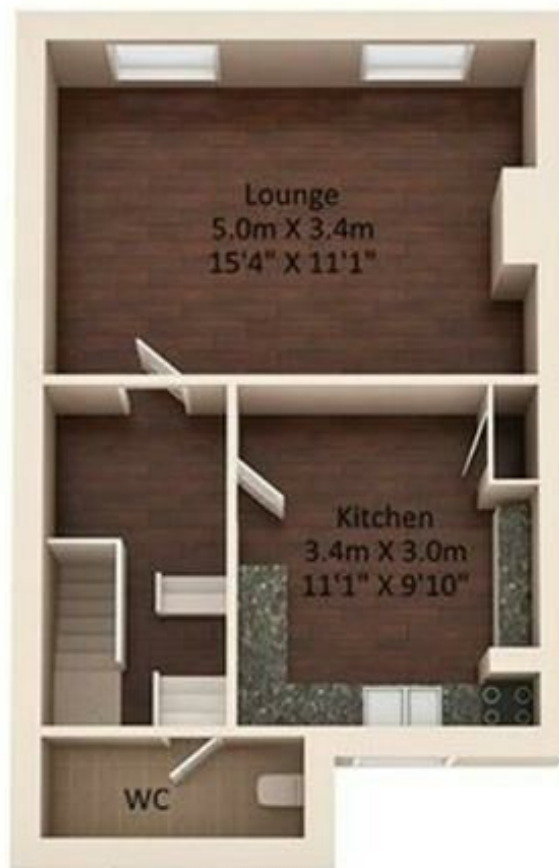
First Floor Approximate Floor Area 397.18 sq ft (36.90 sq m)