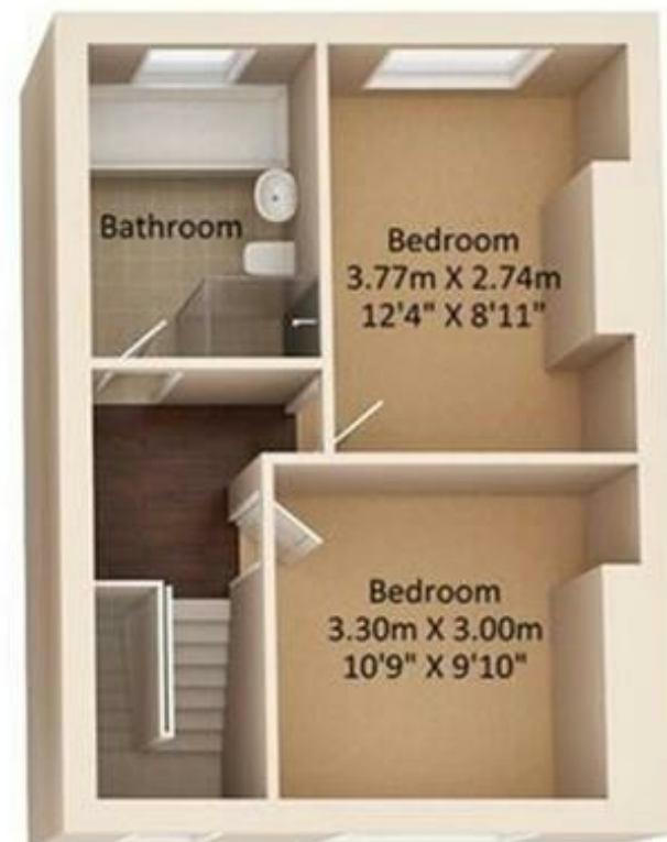
Second Floor Approximate Floor Area 365.97 sq ft (34.00 sq m)