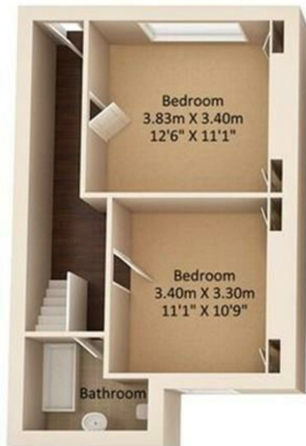
Ground Floor Approximate Floor Area 395.03 sq ft (36.70 sq m)