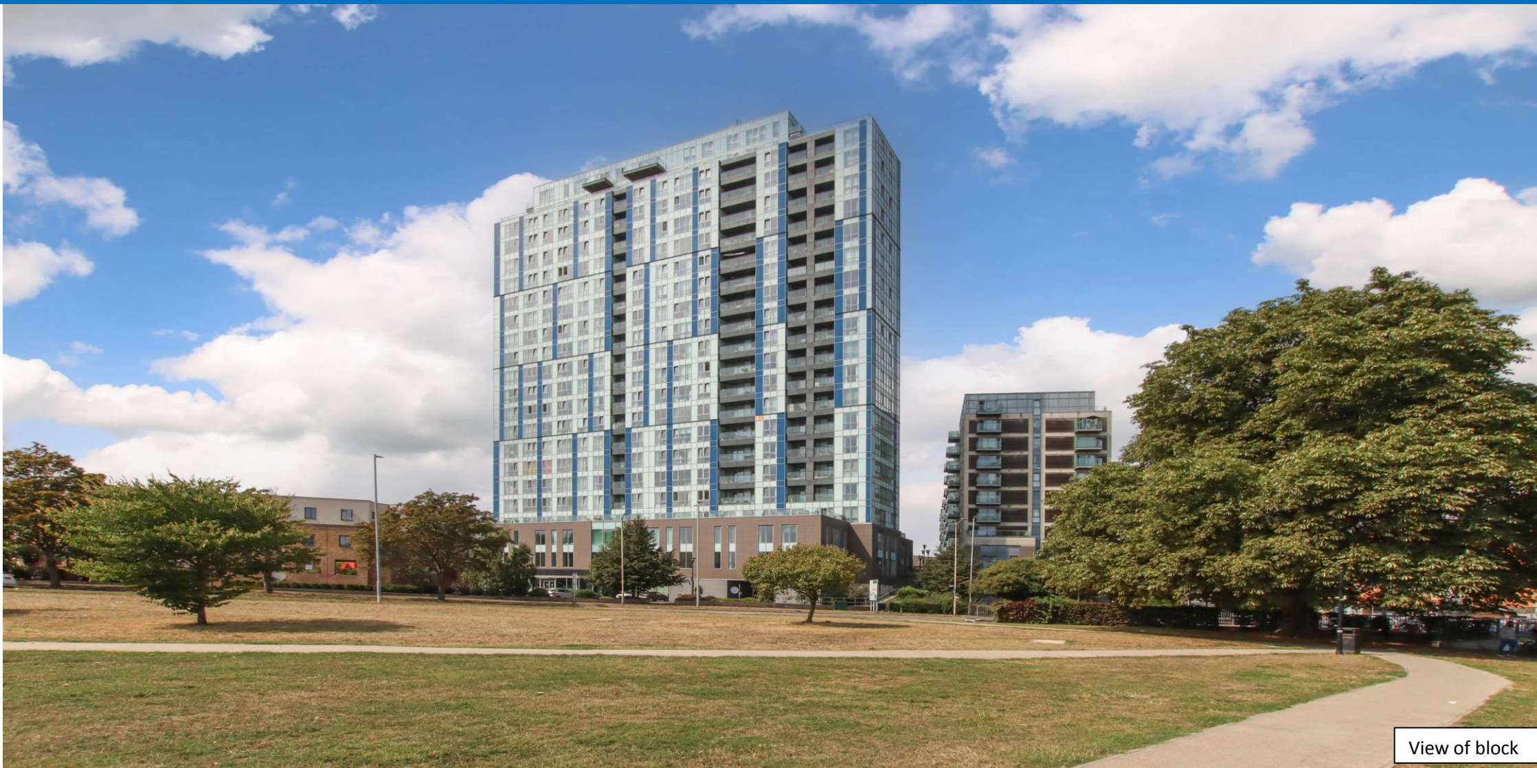
View of block