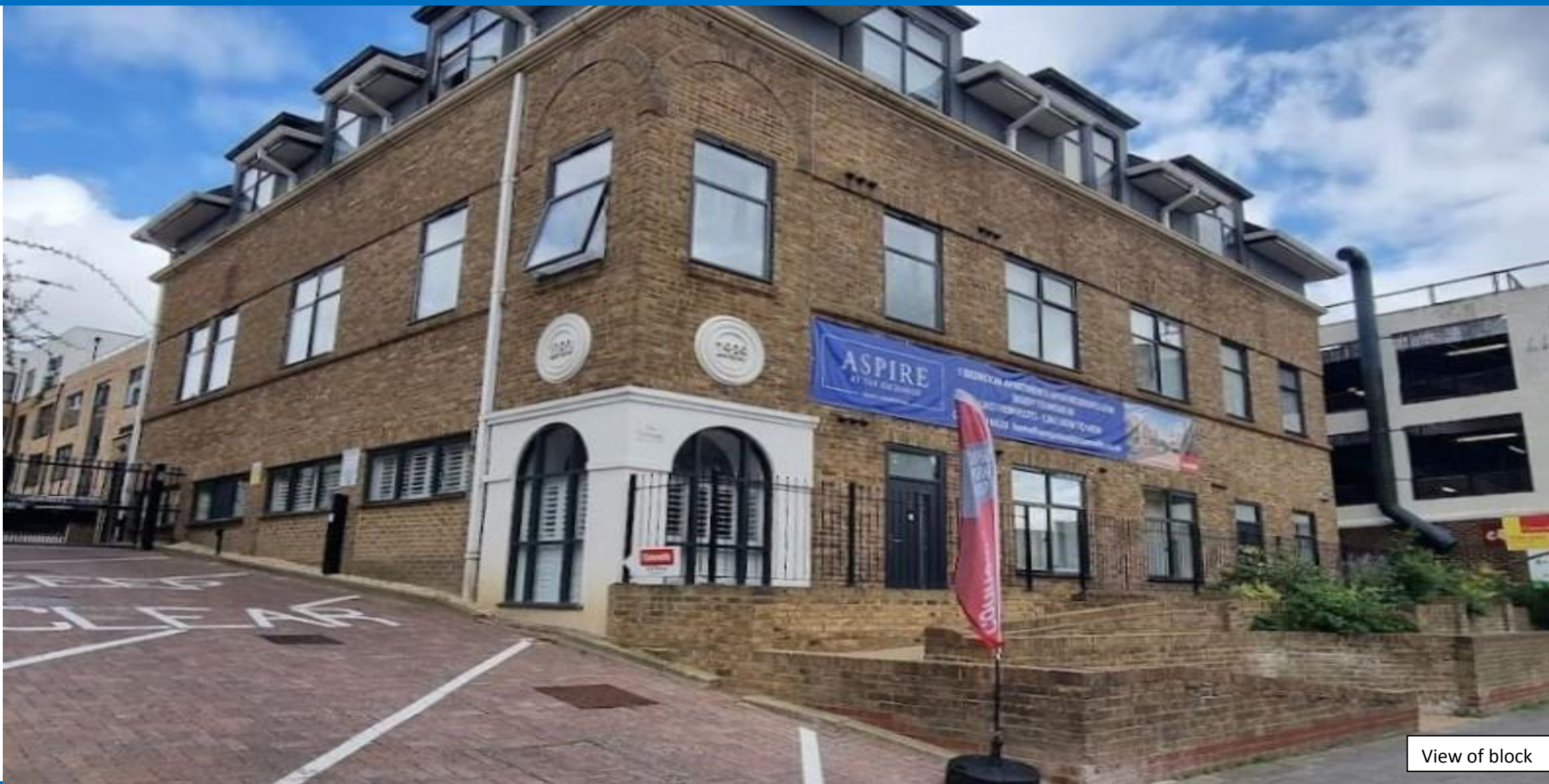
View of block