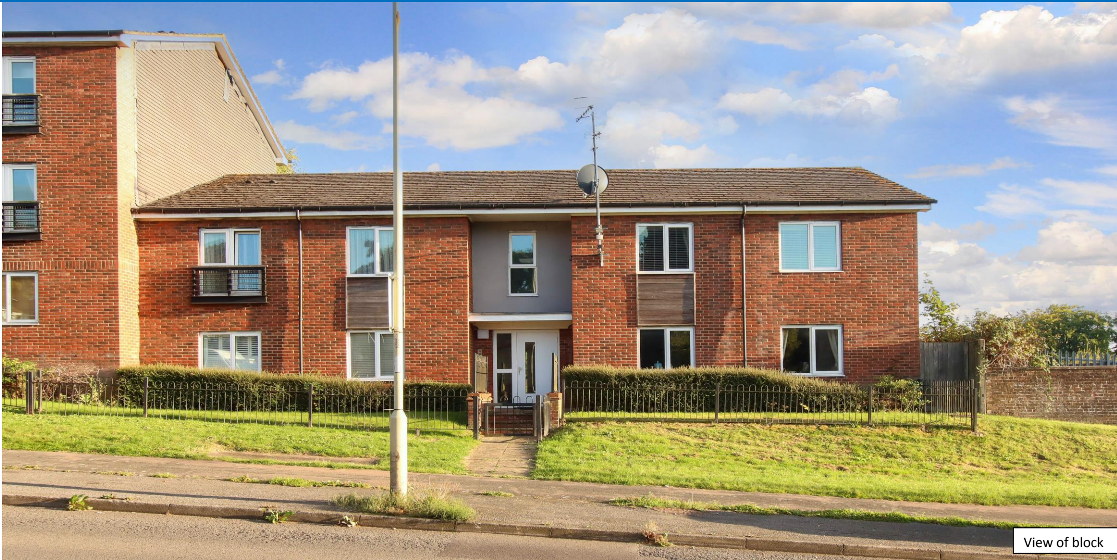
View of block