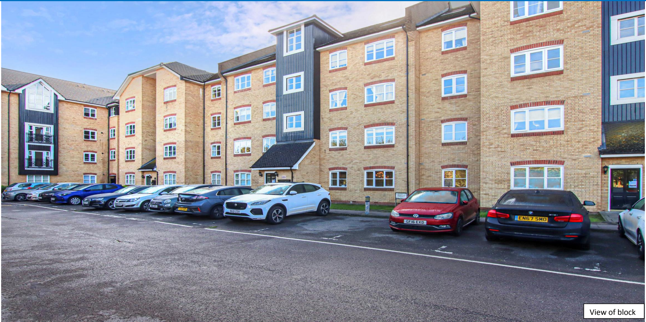
View of block