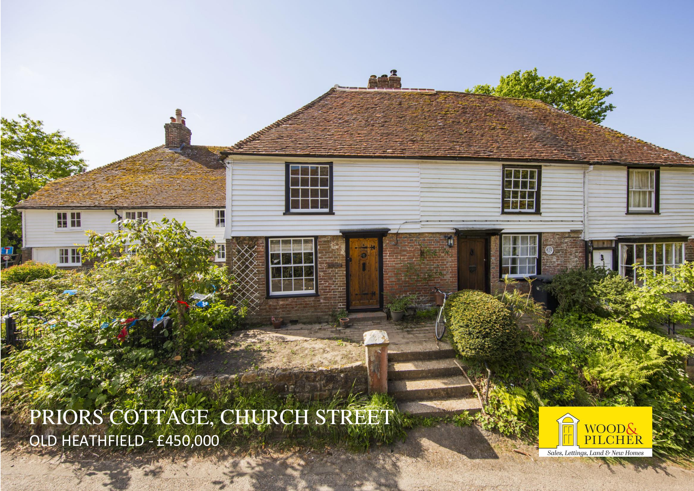
PRIORS COTTAGE, CHURCH STREET OLD HEATHFIELD - £450,000