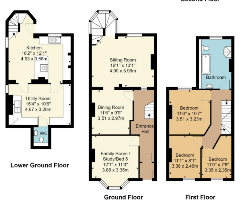
Approx. Gross External Area 2286 sq. ft / 212 sq.m.

Whilst every attempt has been made to ensure the accuracy of the floor plan contained here, measurements of doors, windows, comes and any other items are approximate and no responsibility is taken for any error, omission, or mis-datement. This plan is for ituatrathe purposes only and should be used as such by any prospective purchaser or inentif. This errices, systems and appliances shown have not been tested and no guarantee on their operations or efficiency can be given.