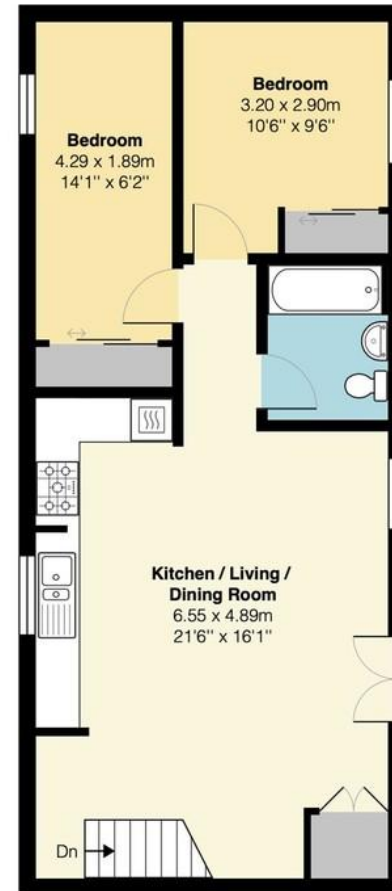
First Floor Approx Internal Area 636.7 sq ft (59.2 sq m)