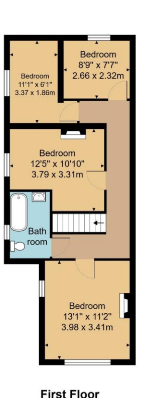
House Approx. Gross Internal Area 1482 sq. ft / 137.7 sq. m

Outbuilding Approx. Internal Area 191 sq. ft / 17.7 sq. m