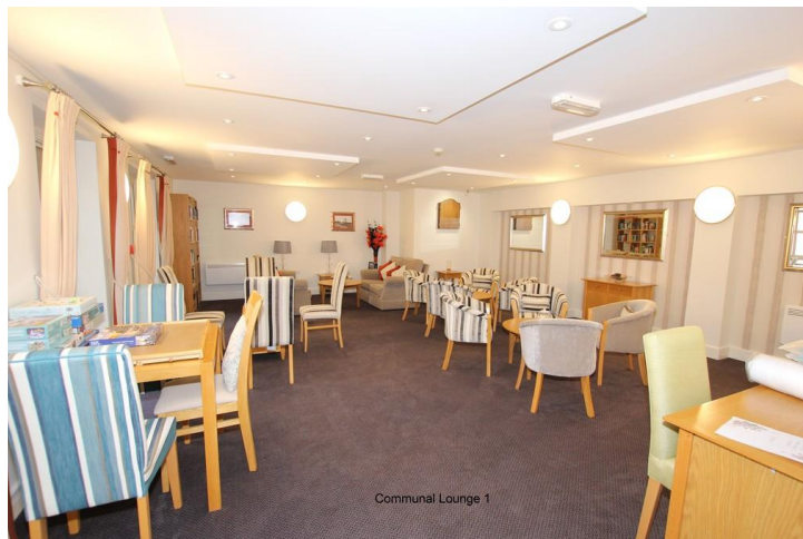
Communal Lounge 1