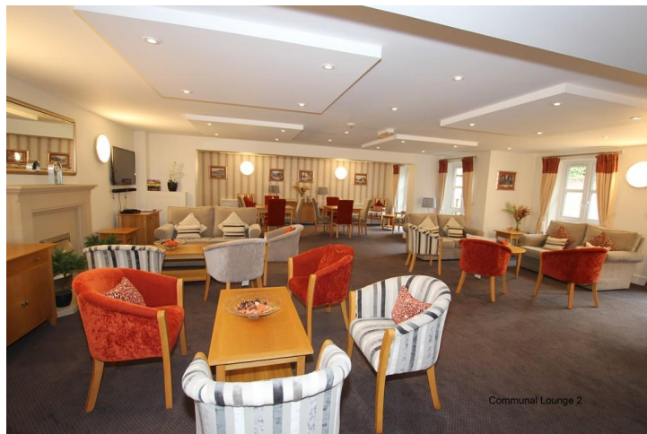
Communal Lounge 2