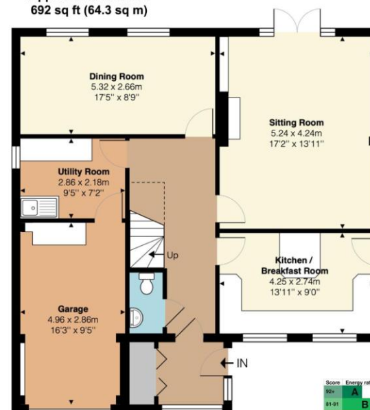
Ground Floor Approx Internal Area 971 sq ft (90.2 sq m) (Including Garage)