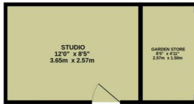
GROUND FLOOR 480 sq.ft. (44.6 sq.m.) approx.