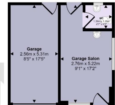
Outbuildings Approx 29 sq m / 309 sq ft