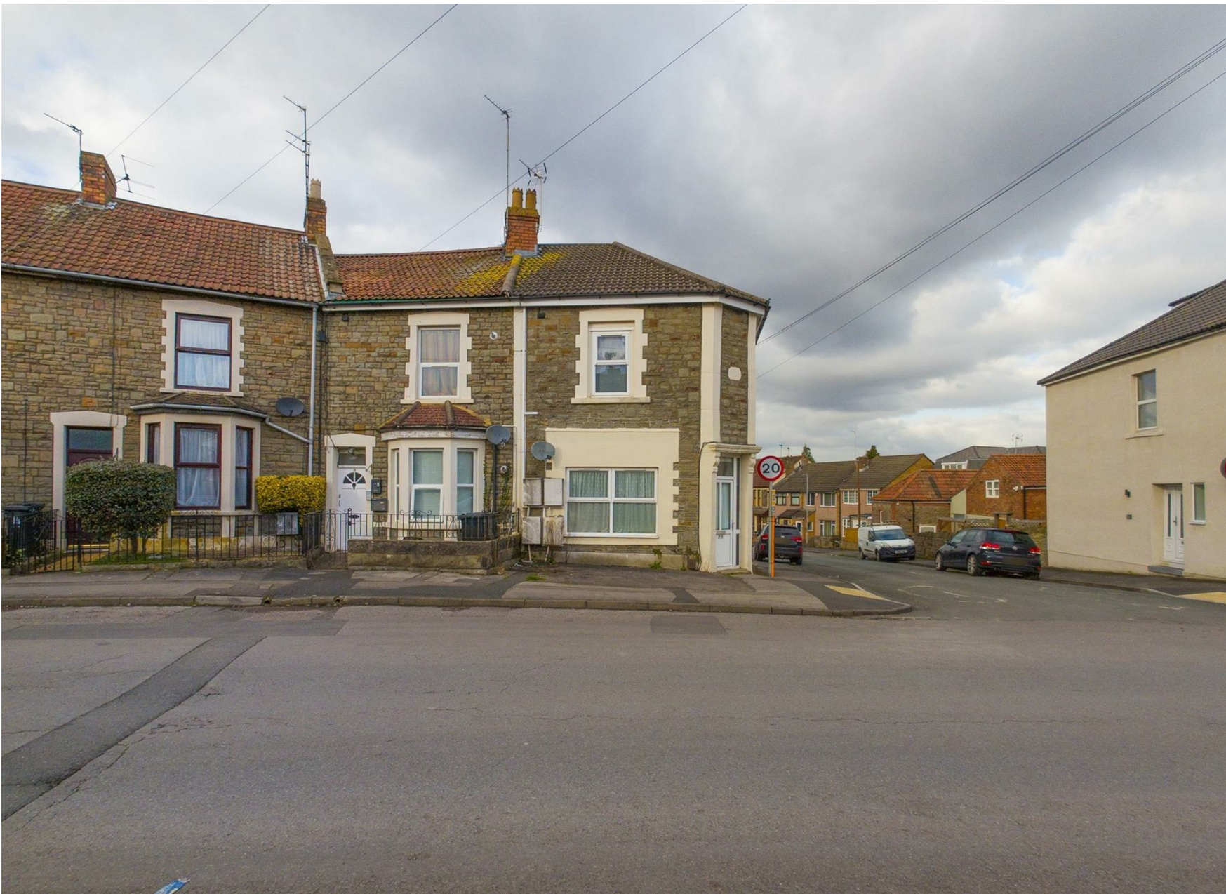
21b Stanley Park Road, Bristol, BS16 4SR £925 PCM