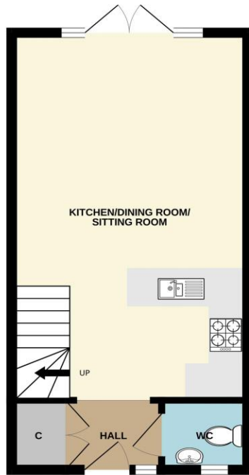
GROUND FLOOR 335 sq.ft. (31.2 sq.m.) approx.