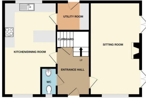
GROUND FLOOR 567 sq.ft. (52.7 sq.m.) approx.