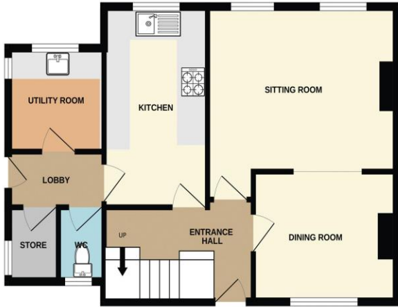
GROUND FLOOR 560 sq.ft. (52.0 sq.m.) approx.