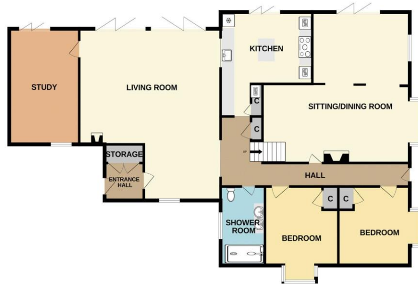
GROUND FLOOR 1926 sq.ft. (178.9 sq.m.) approx.