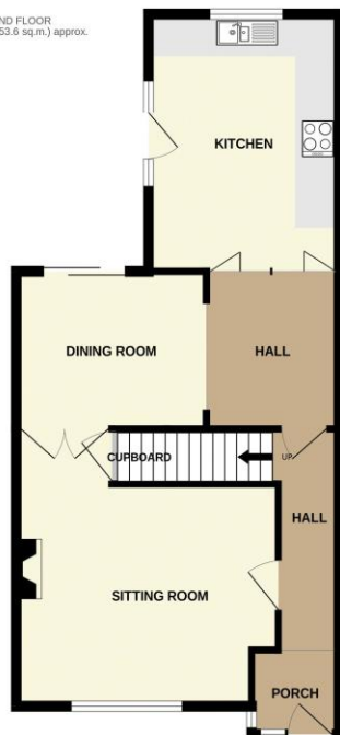
GROUND FLOOR 576 sq.ft. (53.6 sq.m.) approx.