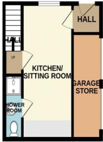
1ST FLOOR 1091 sq.ft. (101.4 sq.m.) approx.